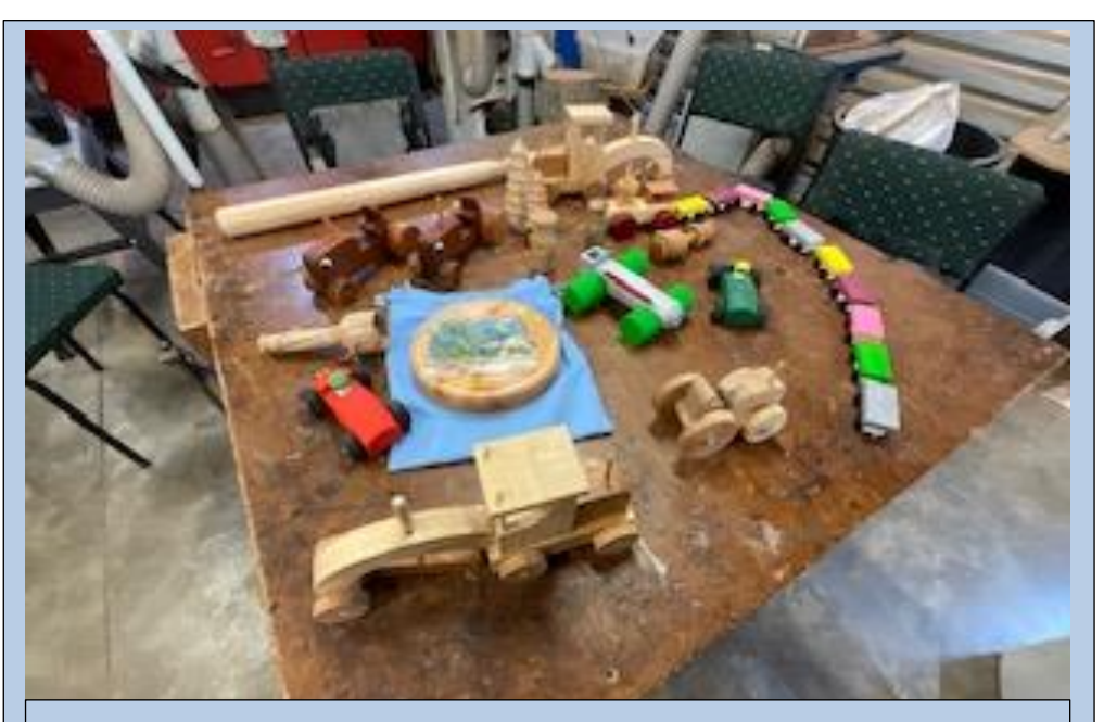
Many thanks to all those club members who found some time to make toys for some special children this year.