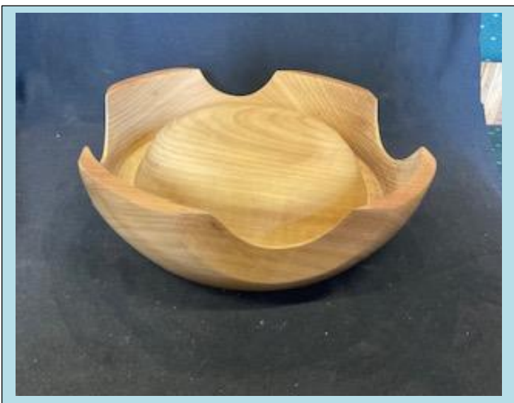
BILL's Four-footer bowl. Great idea and such a fine finish too! This side up then that side down all from a block of liquid amber wood.