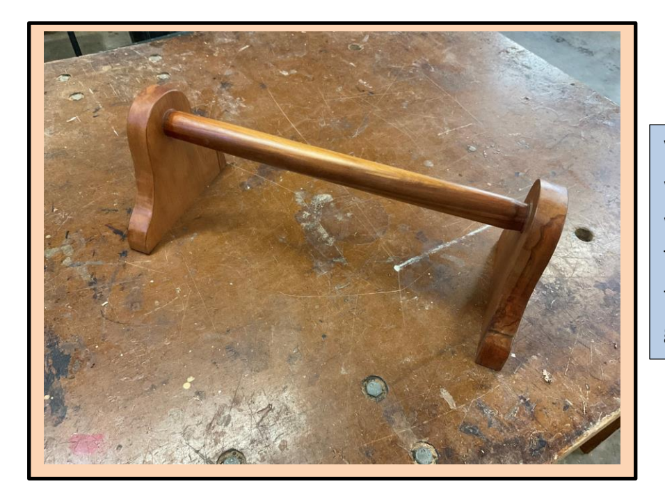
Versatile turner here. DAVID can use wood in other ways. Here is a rimu wood piece of gymnastic equipment. The central rail has been lathe turned into an oval shape for better grip. Clever eh.