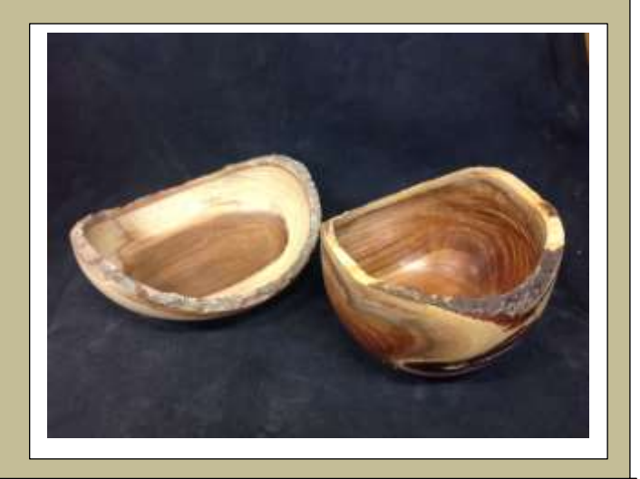
POT and PEN COLIN McKenzie discovered the best block of highly grained oak wood and continues to turn beautiful projects from his woody treasure..