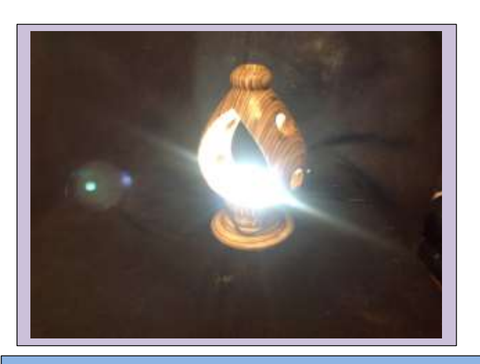
DAVE fitted LED lighting to his outside-in turning. An interesting shape somewhat enhanced with the use of laminated wood.