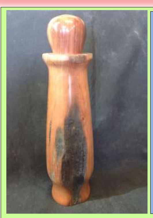
pave new life to an old totara wood fence post.

It's reincarnation took on a tall vase shape with a fitted bung.