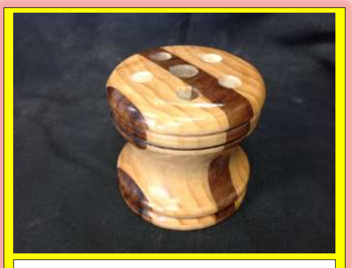
DAVE FREW laminated contrasting coloured wood then turned a quality pencil holder to grace an office desk.