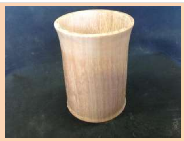
JAMES GEE's driftwood beer tankard. Scoffing ale from that size would drift anyone off to sleep. Super-smooth finish to a top job.