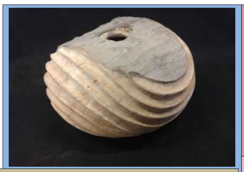
MURRAY's dinky- di contribution to the driftwood programme.

A well-worked hollow form with a carved outer. Some classy dremel tooling here.