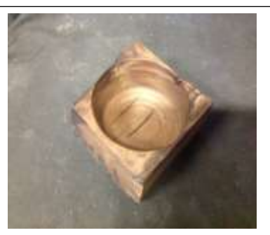
TRAVIS t ried a different approach with his piece of driftwood - squares and rounds all in one.

Very special and clever work indeed. Woo hoo!