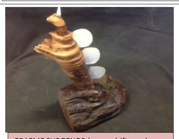
GRAEME SURGENOR 's zany driftwood creation with bits sourced from Waihi beach. A goodonya gong for this one.

Very smart and well thought out process in this one-piece project of pine wood.