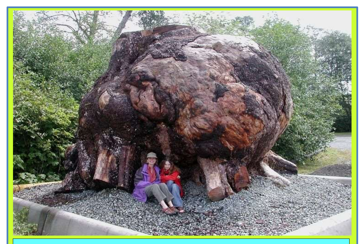
Guess how many turnings you could get out of this beaudy-bonza burr.