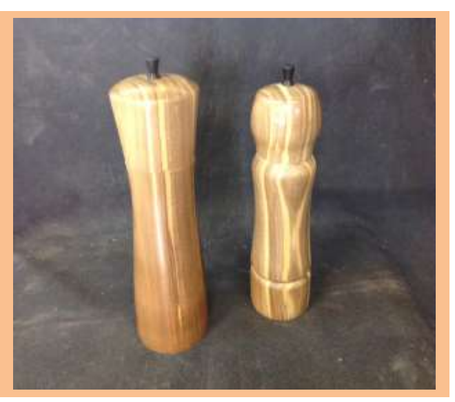
Using 2.5k swamp kauri, RICHARD and HEATHER completed their first foray into pepper mill making.

Their first-ever mill projects are a top credit to both these new turners.