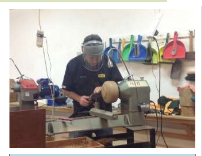
OK safety gear now on and the initial shaping begins