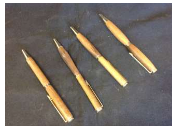
The team of newbies learned the basic skills of turning a pen. (Ironwood)