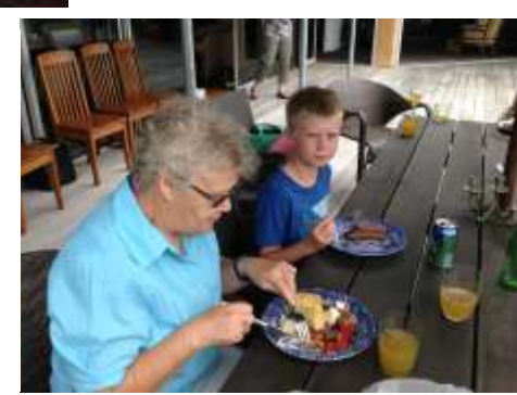
Savouring every mouthful of food fit for royalty.