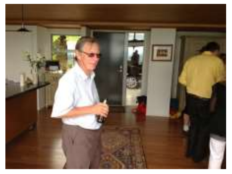
"Sssshhh, With these dark glasses, I'm incognito."