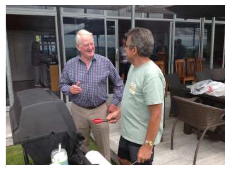
Cooking venison back-steaks: "Now how big was that stag you shot?"