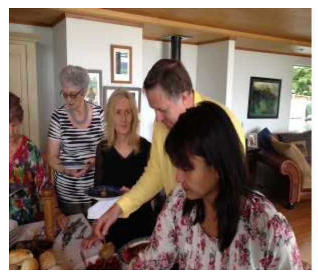
"OK I'll have some of that and some of that and some of that and..."