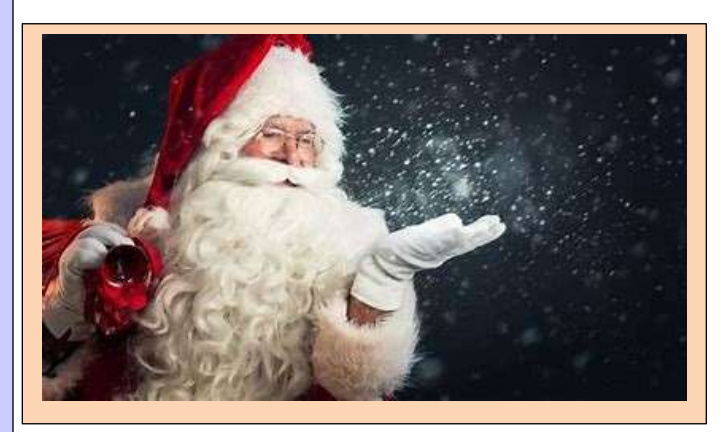
HO,HO,HO see you and your spouse/partner/mate at ROBERT's place on Sunday 6th December, 11.30am

CELEBRATION: All members are asked to bring some special turning projects completed during the past year 2020. These will be put on display for all to admire.