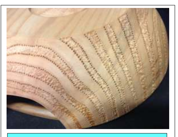
This is a close up photo to capture the trillion holes Murray needed to drill, then apply etching in between the rows of holes.

This turning will be finished with the application of SOAP flakes ????? The mind boggles! SOAP flakes ??? (Watch this space)