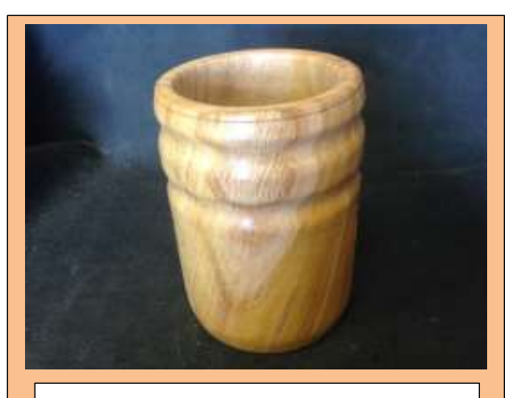
MALCOLM D made good use of a cup chisel to hollow out his chestnut wood pot.