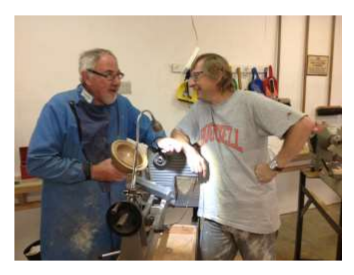
"Near Enough Aint Good Enough (NEAGE) philosophy is what I stick to and is probably very good reason I can now get especially good finishes to my work!"