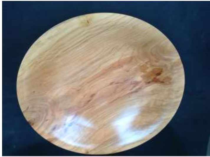
Plum wood bowl turned by RICHARD – no stria, no scratches, no dimples or pimples, just a perfect turning job.