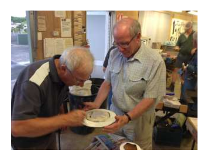
"Well first you need to mask off the bits not being painted then you....."