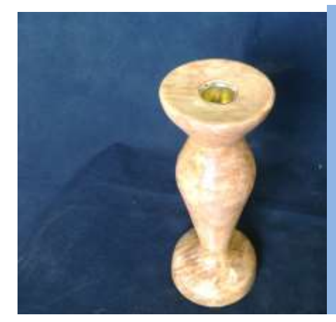
GRANT Taylor used a short length of macro burr for his highly figured candle holder.

MALCOLM's block of cherry wood has been transformed into a natty bowl with undercut feature and edge embellishment. A top job here!