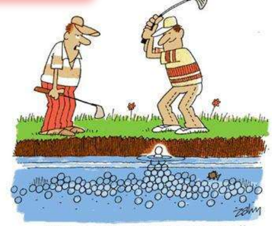
"You were really lucky your ball didn't go in the water!"