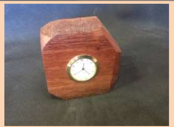
JAMES took the <u>time</u> to mount a mini clock dial into a randomly shaped block of jarrah wood. Didn't need a <u>second</u> attempt and the job was done in a <u>minute</u>.