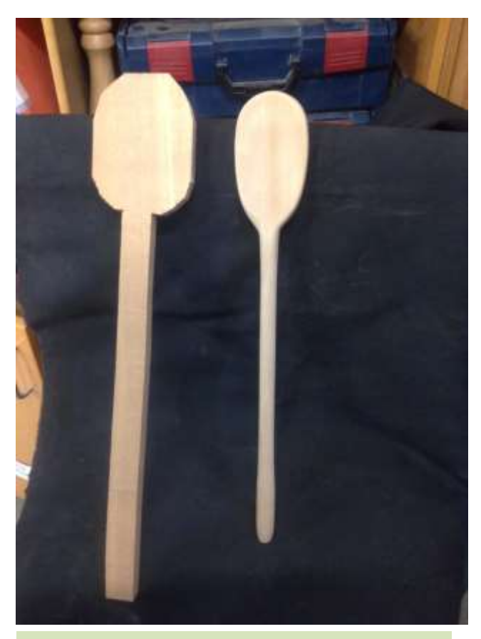
ANDRE` has been busy turning wooden spoons. No, the wooden spoon is not for the Waikato rugby team but it will be gifted to someone's kitchen.