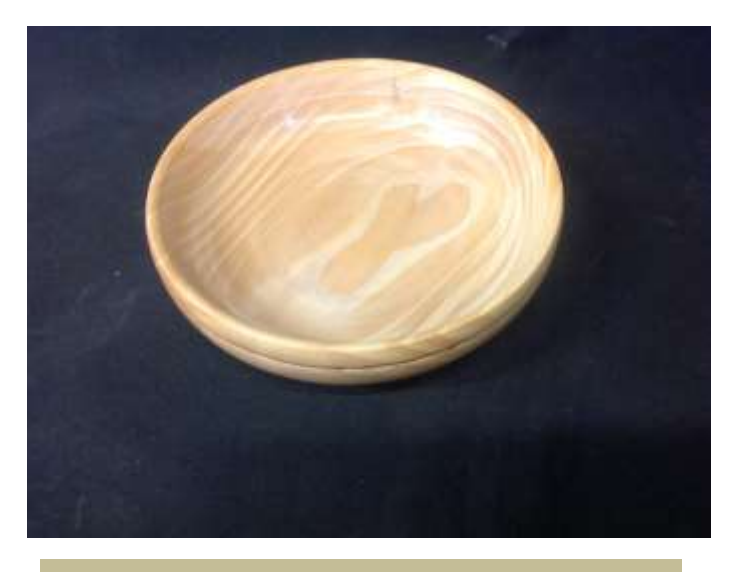
MELISSA has been with the club for about one month, completed three projects and showed her woodturning potential. Early success through quiet determination!