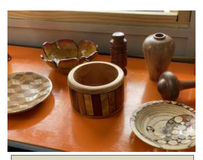
More 2019 turning projects