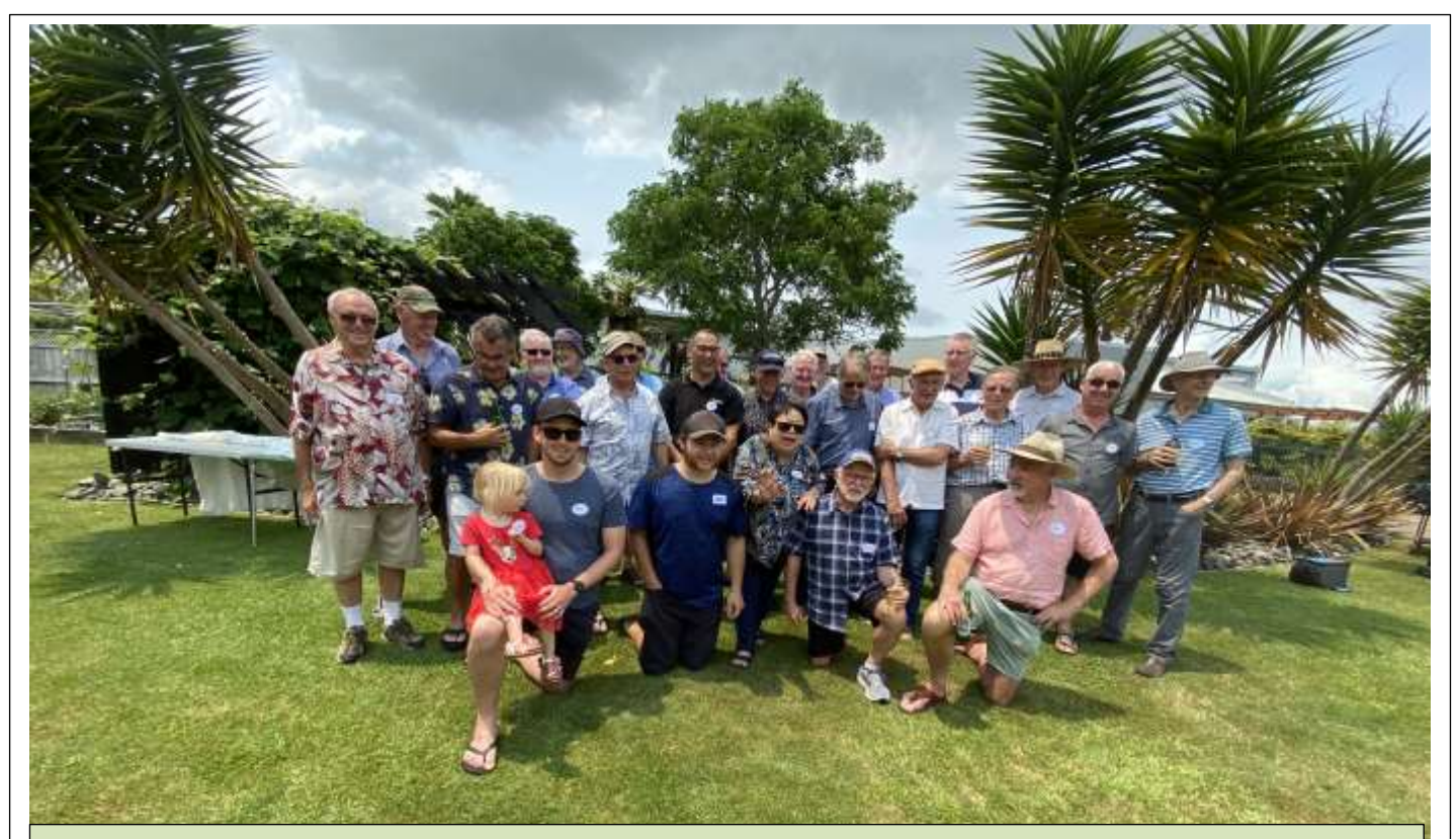
Here they are! A mix of our Tuesday, Wednesday and Thursday turners.

This lot and their partners enjoyed the food, the company and the sunshine (just before the rain storm)