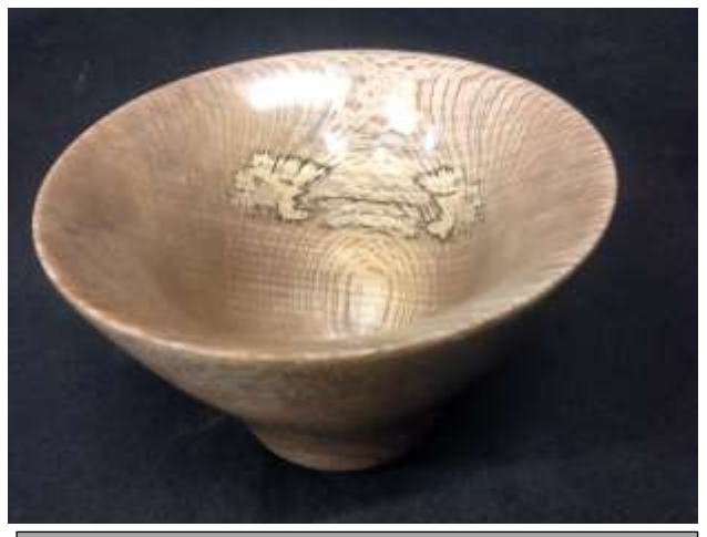
New member BRADLEY successfully completed the club's introductory programme this week. A NEAGE approach, and a good memory for procedures has enabled Brad to create the excellent turning shown above.