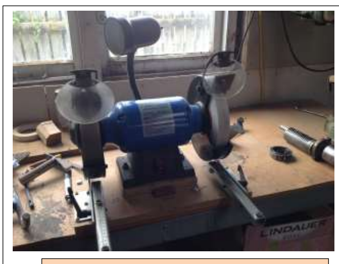
A top quality sharpening ststem