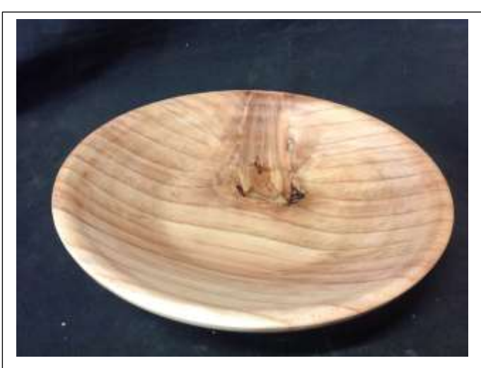
(above left) SPENCER's nifty little yew wood bowl shows off some fizzy grain patterns while the large redwood bowl ( above right ) proudly displays its winter and summer growth rings.