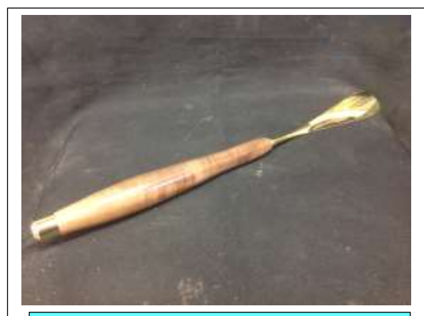
STEPHEN O'Connor produced this long-reach shoehorn in quick time.