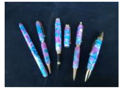
HEATHER turned a metrelong strip of resin into a full set of skillfully made writing tools.

This week's TUESDAY session was just about one of the busiest this year. Not only because we hosted a group of visitors from the PROBUS club but the number of projects completed in one session must be the highest for this year. Check out the pictures that follow.