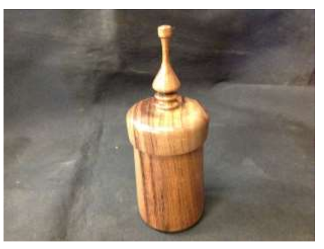
A superb mini-pot by AARON