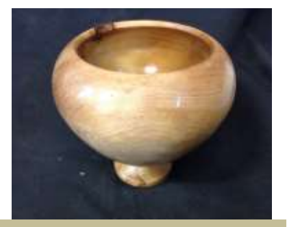
Three pictures above capture the turning creations by our Gideon . Very smart work here.