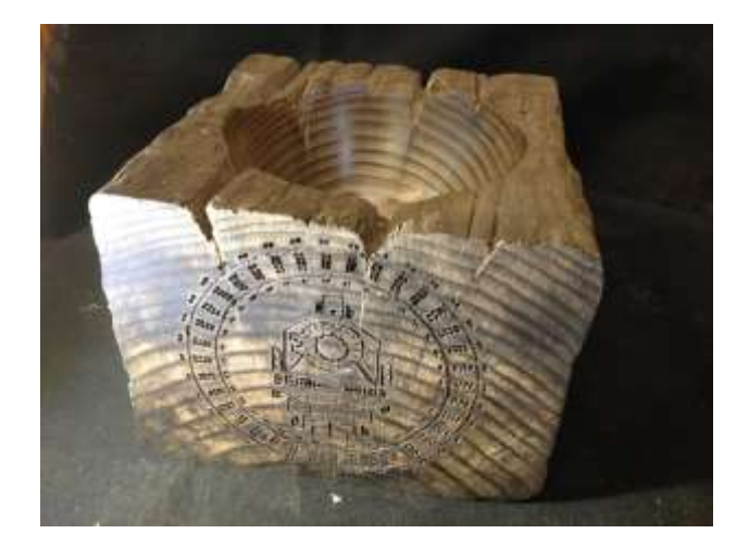
DYLAN beavered away at this very special project. (history revitalized)