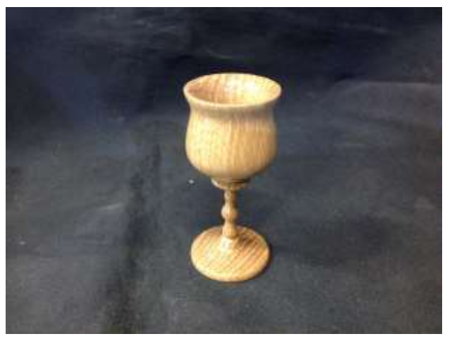
AARON's skillfully turned mini-goblet