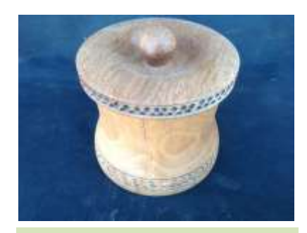
JOHN is winning the challenge of fitting a lid to turned pots. Confidence begets competence. Well done!