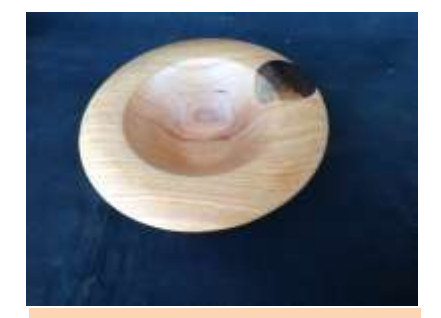
More experimentation from RICHARD. This time a cut swamp kauri plug has been added to macro wood.