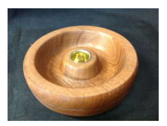
CORMAC makes great progress with his candle holder.