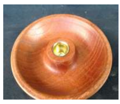
JOHN used a block of cedar wood for his smooth-finished candle holder project.