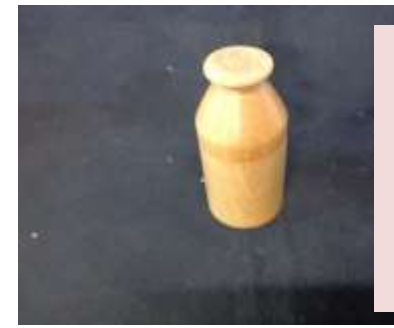
MALCOLM's first shot at a mini-pot with a flush-fitting lid. Methinks there will be more pots to come. Woo Hoo!

RIC used rimu wood for the pot and kauri wood for the friction-fitted lid. More essential skills were learned during the job.