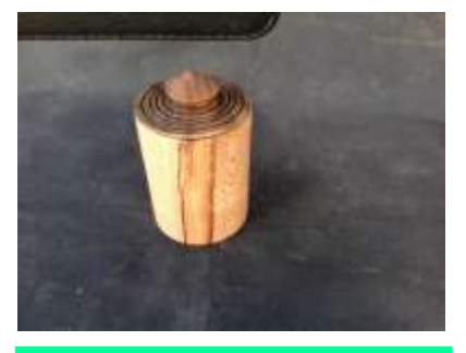
SHAUN used rewarewa and black walnut wood or his natty mini-pot.