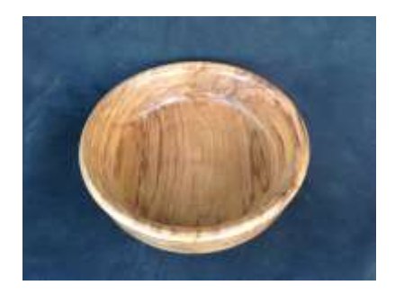
MICHAEL turned a block of four pieces laminated rimu wood into a large shallow bowl. The laminations helped to create interesting grain patterns