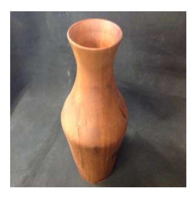
MALCOLM , from the Wednesday group, used an ancient totara fence post and turned it into a snazzy vase.