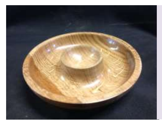
GIDEON continues to impress!