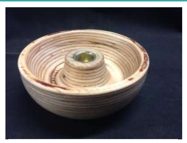
AARON used a block of wood laminate for his candle holder and learned how to fill holes during the turning.