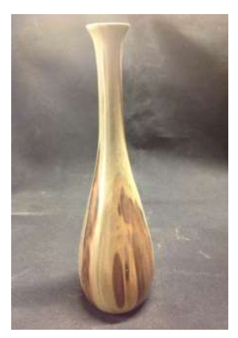
DYLAN used 15,000 years old swamp kauri for his beautiful slender vase