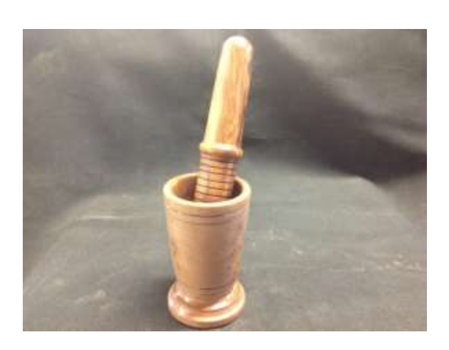
DAVID used a combination of pohutukawa and buckthorn woods for this excellent effort.