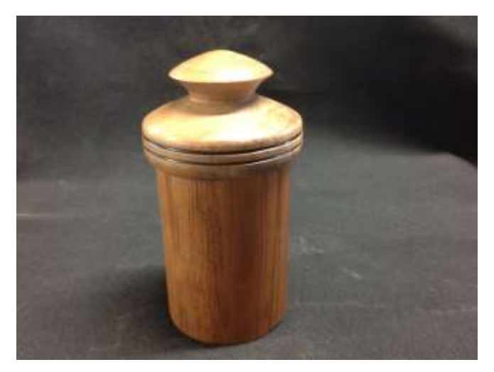
CORMAC used rimu wood for his mini-pot with a friction- fitted lid. Great care taken to remove stria. Well done Cormac.