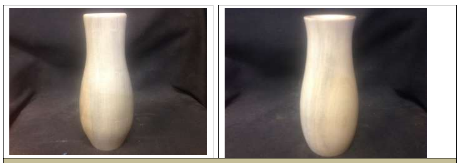
CHARLOTTE (left) and LANCE LYDEN (right) used poplar wood to make their classic "S" shaped vases. These new turners are making rapid progress through the club's induction programme. Woo Hoo!