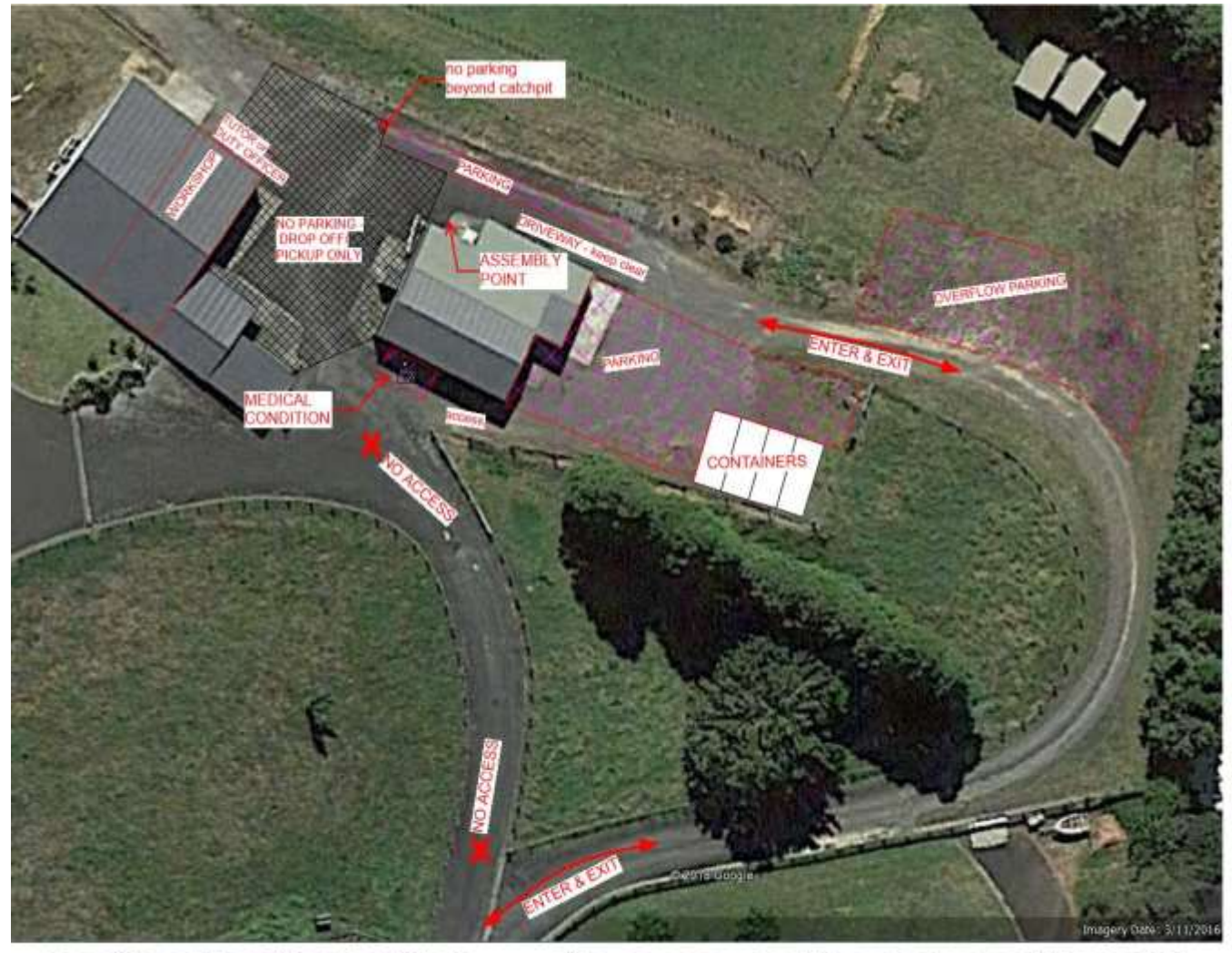
Hamilton Woodturner/ Club - vite access, parking and assembly point

PARKING .... an issue that needs to be addressed.