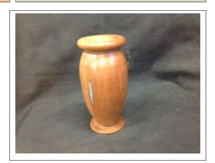
MALCOLM Vaile can turn a pot/vase like this one in no time at all. That includes adding turquoise dust to fill the cracks.