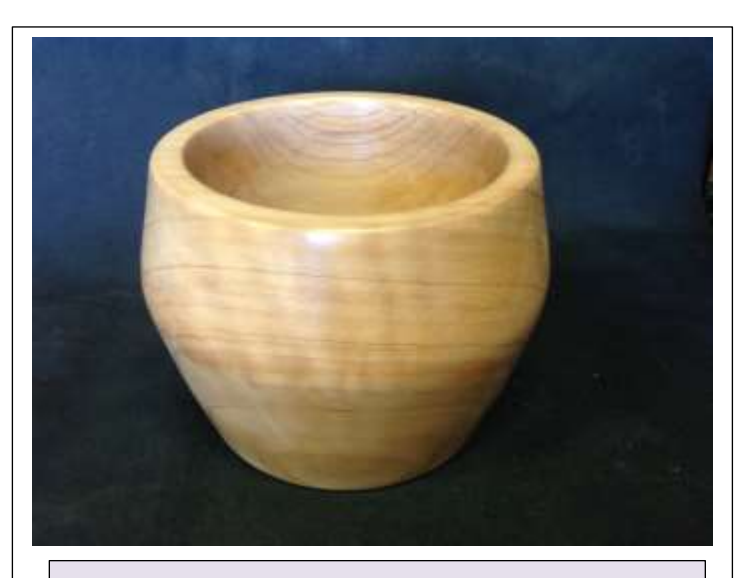
MICHAEL DOYLE's sturdy-walled pot made in the final week of LOCKDOWN

All members are strongly advised to wear suitable dust protection while turning and sanding wood.