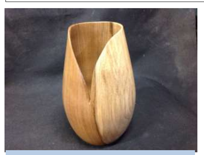
COLIN used Kowhai wood for his evenly-walled fold-over vase. Another prized gem.

These two super-keen recruits have made a flying start to their induction programme.