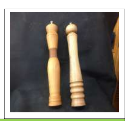
GIDEON has been busy in his workshop again as evidenced by these three turnings. A totara-post jug, a totara vase and a set of pepper mills.