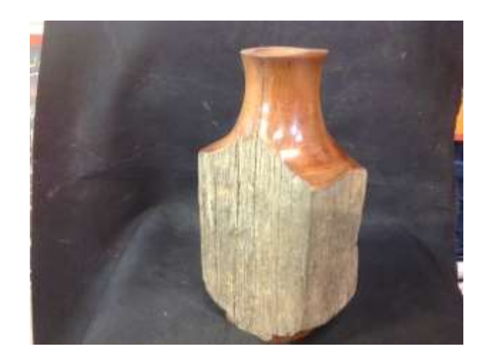
ROSS reckons he's not very creative but who would believe that after producing this excellent totara form.