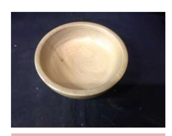
ED then found some time to complete an earlier project - a small bowl.