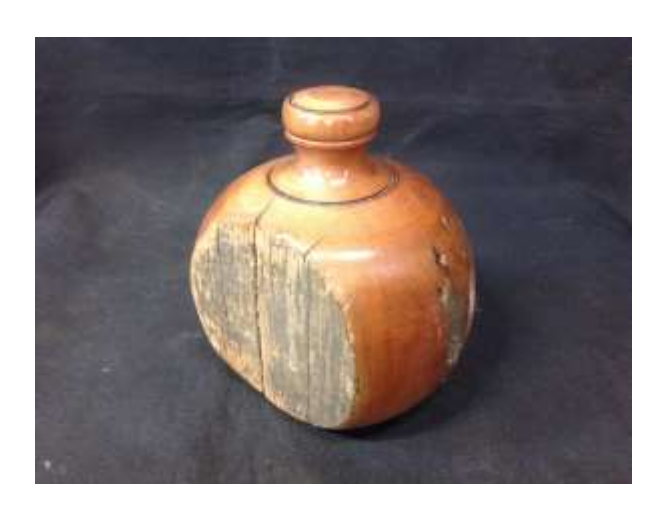
SPENCER produced a winner in this well-proportioned totara form complete with stopper-bung. Neat, natty and novel.