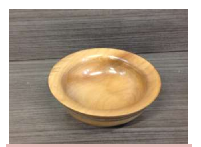
STEPHEN's North Auckland kauri bowl. Wow what a finish!