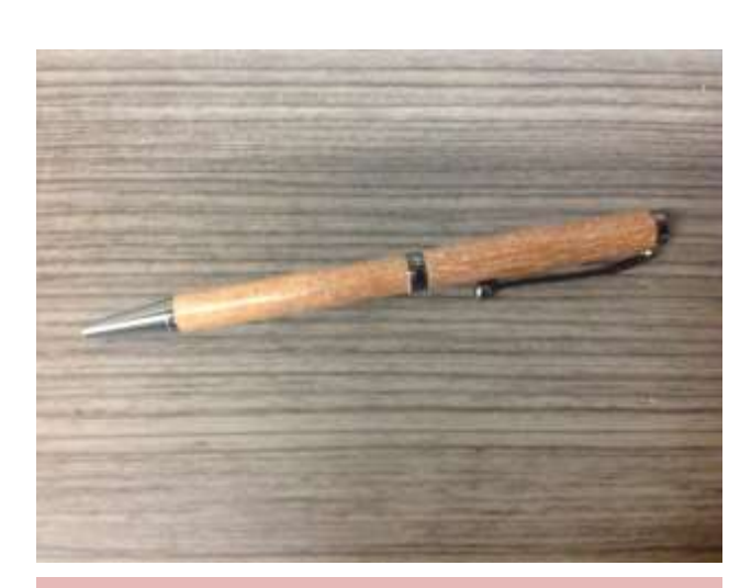
KATRINA was so pleased with the pen she made last week that another pen of a different style just had to be made.

Mahogany wood was used for this pen. And now it's on to pepper mills.