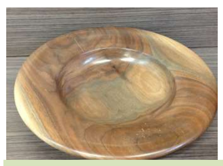
STEPHEN's Australian blackwood of many colours captured in a smart finish.