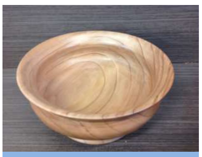
ROSS used a big lump of redwood to turn his large fruit bowl.