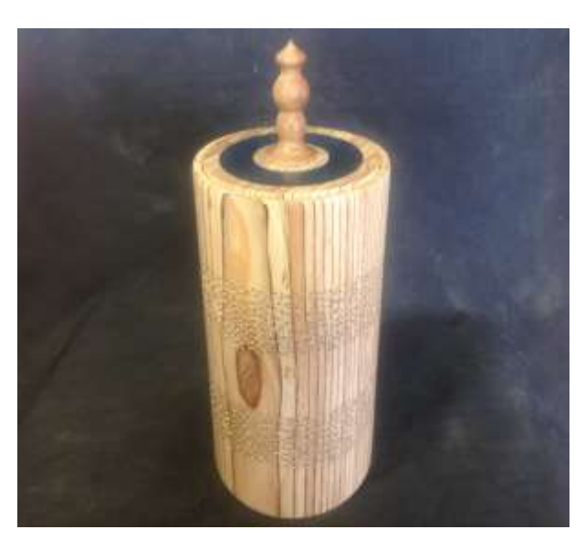
CAELAN showed determination and perseverance in making his laminate wood lidded pot with its "pukeko" blue insert of resin. Next step: making finials using mini tools.

DAVID made this highly attractive bowl by surrounding a bowl of macro wood with a wall of pen blanks, each of differing wood type. Infills of black resin was used to separate the vertical wood columns. A top achievement here.