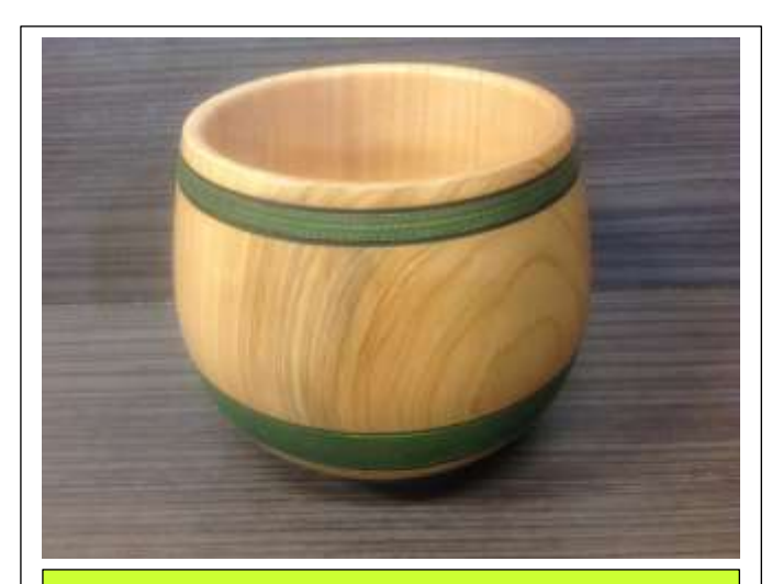
A superb example of careful project work. A great design and choice of colour added to an optimal turning. Goodonya SPENCER !