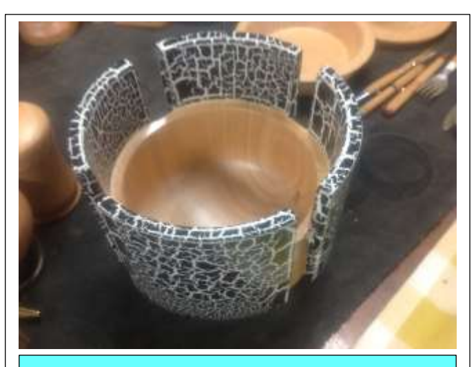
ROBERT's cube creation is adorned with a surrounding split wall featuring of black-on-white "crackle" paint. Another outstanding turning outcome.

COLIN turned his cube into a beer mug featuring coloured sections around the waist and along the handle. I reckon it holds more than the regulation pint.