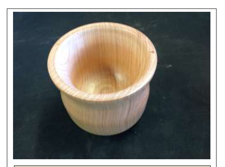
JAN beavered away with her cube to turn it into a round, deep profile pot.