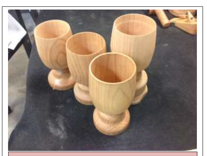
ANDRE ` scored four goblets from his macro cube. Look at those thinly turned walls of each goblet. Wow!

SAM created a three-sided deep profile bowl with a heap of patience and determination. Smooth transitions all over the work. A cunningly contrived work of art!