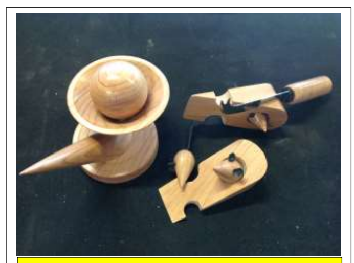
GRAEME used the theme of mice and cheese to turn his cube into a cute display of ten bits of cheddar-ed macro. Angles, points half-circles, arcs, curves, conical and spherical shapes made this work a special challenge.