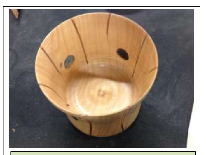
MIKE Bodey's lampshade (shown upsidedown) is a cleverly-made, quality turning . Clear resin streaks and spots will allow light to penetrate.

MALCOLM Vaile's three-sided macro bowl features equi-distant points with a smooth transition flowing across the base. Great chisel work here.