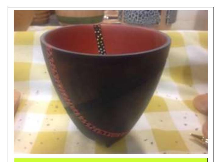
It just gets better each week. MURRAY's skill and patience pays off handsomely with this excellent cube creation outcome.