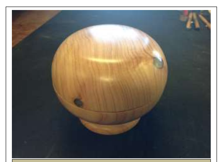
RAY's interesting ORB bowl has a top and base that fits like the proverbial glove. Neat, tidy and well finished. From a cube to a hollow split form.