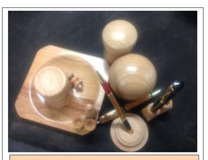
AARON used every last bit of his macro cube to present a selection of interesting and well-turned goodies