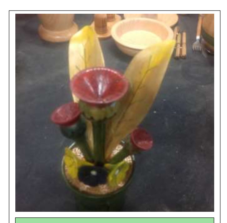
It seems like COLIN's creative mind knows no limits. Believe it or not (Ripley)....this unique display is all macro wood gleaned from a 150mmX150mmX150mm cube.