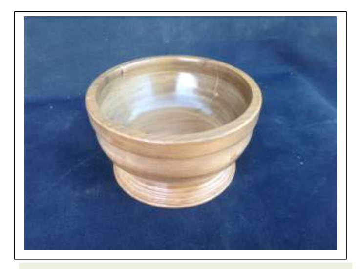
Spindle turning with roughing gouge practice.

GRAHAM, one of our new members, completed this project - a paper pots maker - during Tuesday's session. He made very good use of a variety of turning tools to complete the job in good time. Then a start was made on the next STAGE ONE project – small bowl turning.