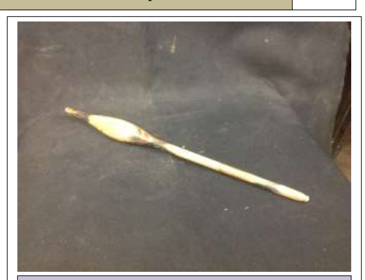
MELISSA is very focused on making practical objects and regularly turns gizmos and gadgets for use in craft work This skilfully-made drop spindle is a good example of her careful approach to turning.