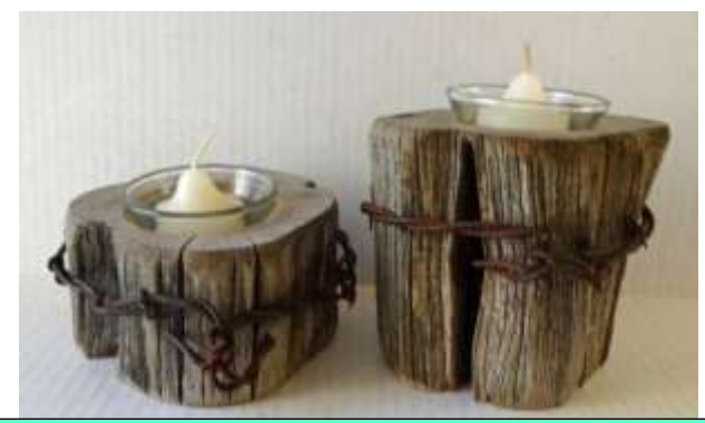
Be brave and have a go at being different with your post turnings. Start now!