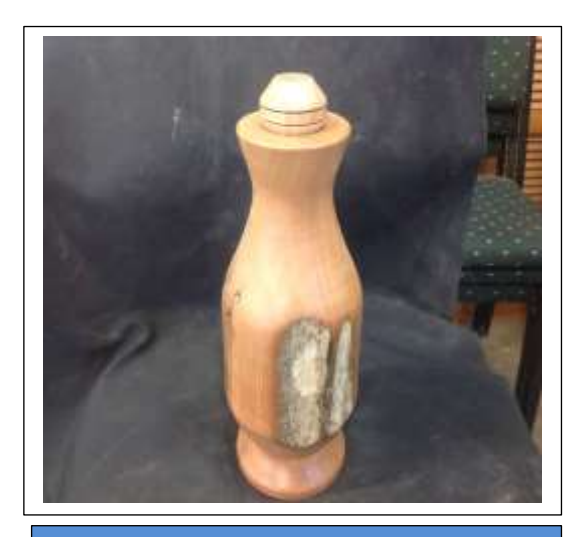
WAYNE leads the way into the next whole-club project. Woo Hoo!