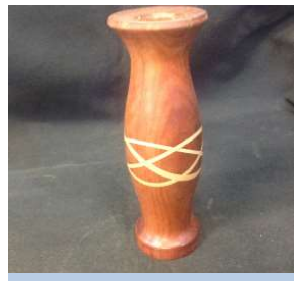
stephen o'connor has found considerable success in experimenting with patterned inlay (banksia wood). This effect has enormous potential for enhancing turnings of all sorts.