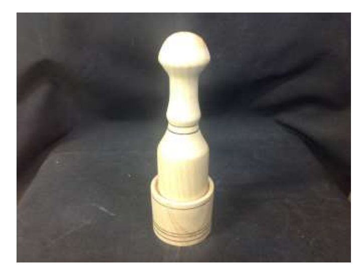
KATRINA is one of the club's newest members who has almost completed the club's induction programme. This week's paper-pot maker (pictured above) is a fine example of successful spindle turning skills. Next week it's an introduction to face plates and bowl turning. Goodonya award!