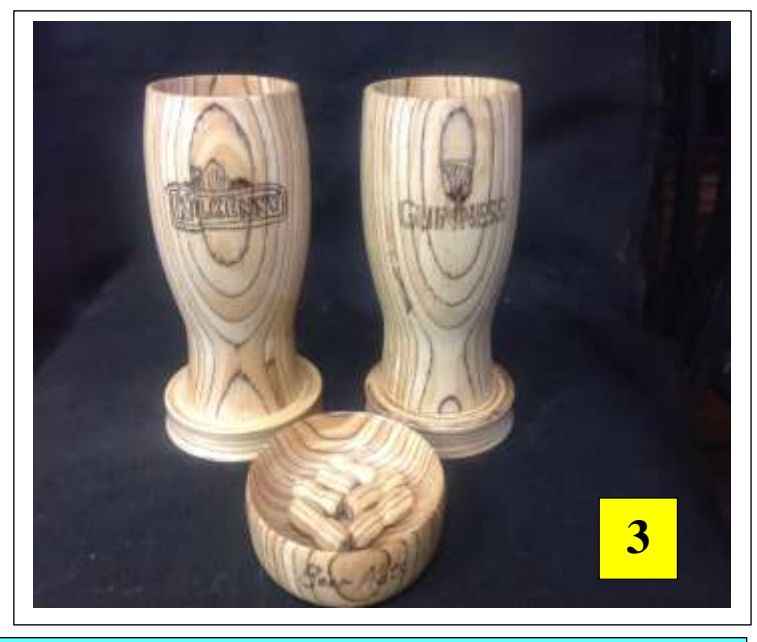
The LAMINATED WOOD project closes on 31st May. How is your contribution progressing?

If completed already, do hand it in for photographing. Start a second one if you wish.