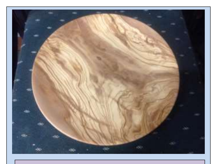
Wow! Look at the swirly grain lines and colour variables of brown and cream.