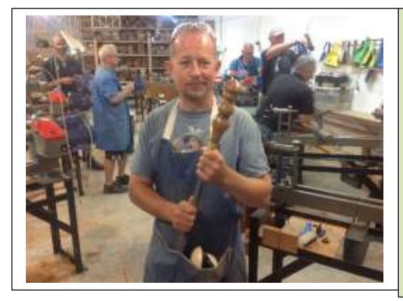
THURSDAY's two new members.

A special welcome to our new members. They all look pleased with their first project completed after just one session. Well done!