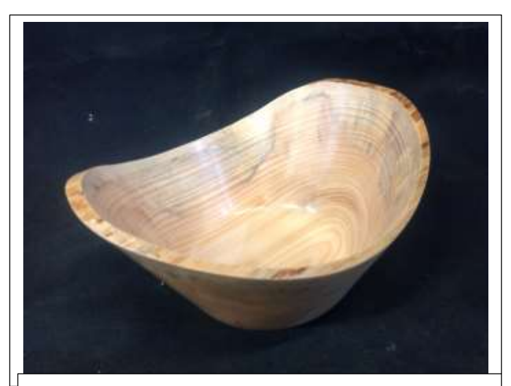
SHANE Forshaw's first attempt at a natural edge bowl. A high-class outcome!