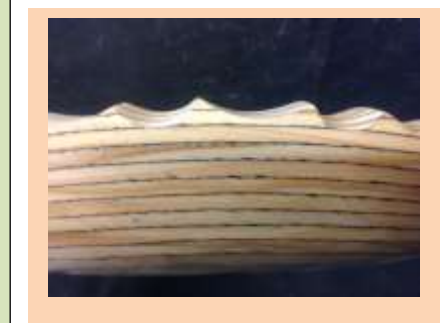
MITCHELL turned this platter from a <u>slab</u> of pine laminate. Note the scalloped edges that were achieved with the help of drum sanders. It will be interesting to see what Mitchell can turn a <u>block</u> of laminate into during the next week's whole-club project.