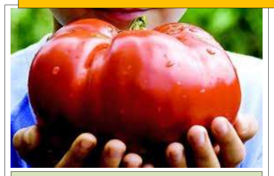
One of my smaller "tommies"