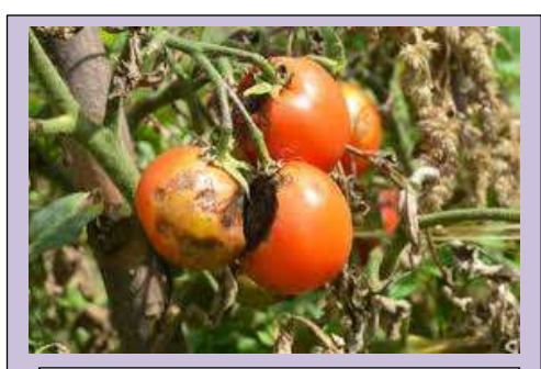
These wonders were the result of using mighty, mysterious and magical mushroom compost as used by some keen gardener blokes.