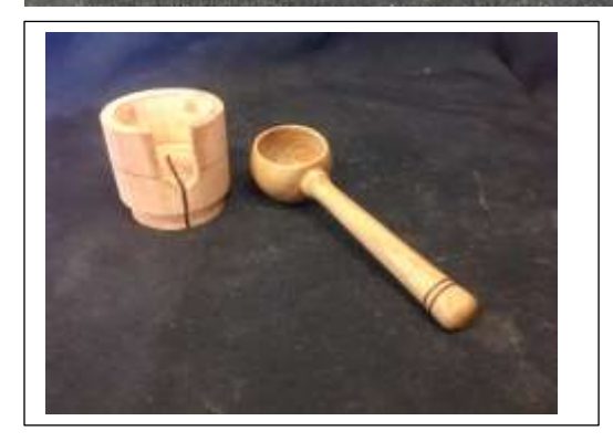
Left: A one piece sugar scoop and its nifty jam chuck to enable the scoop section to be turned. Right: A picture showing how the jam chuck holds the scoop for turning.

This small oak wood plate was coloured using ammonia gas.