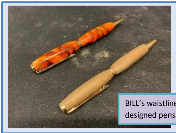
BILL's waistline designed pens

Well, you can't tell by sampling just one mouthful.....it usually takes three or more!