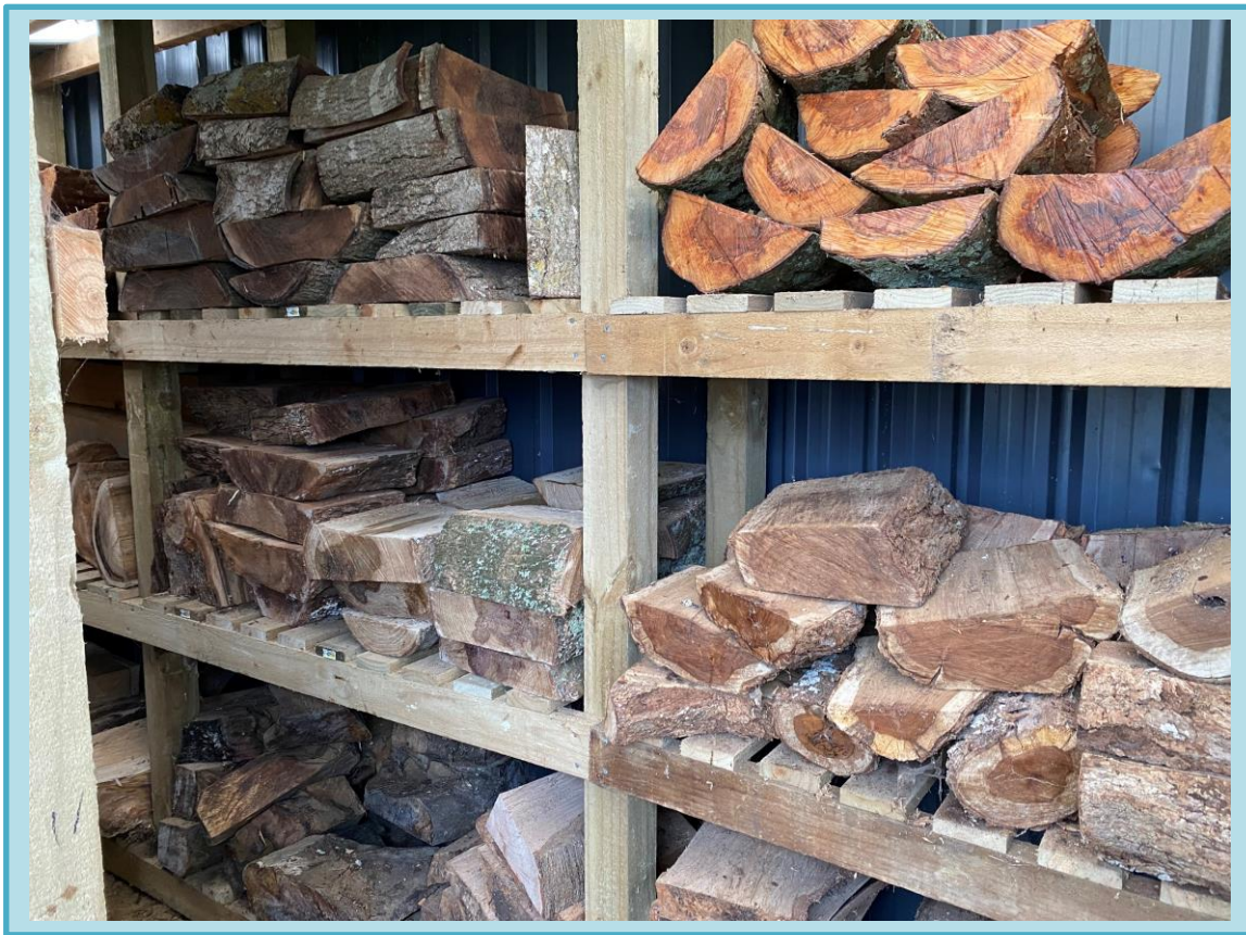
Woodturners' club wood being dried in storage in one of COLIN's sheds. Thanks Colin - much appreciated.

Woodturners need a constant supply of clean well-seasoned (dried) wood. Here's a well-organized treasure trove of wood types. All blocks and slabs have been labelled with wood type information and storage dates.