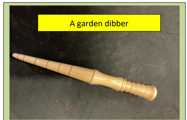
A garden dibber