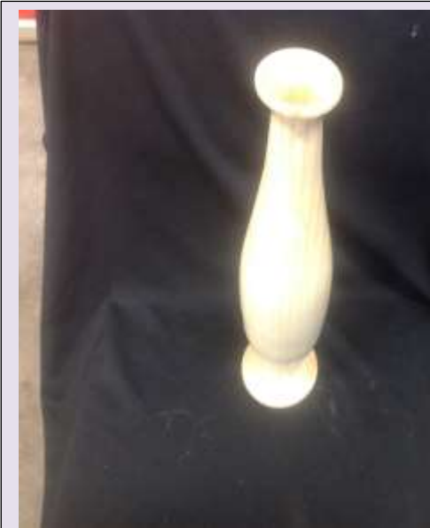
The quality of TREVOR's second project indicates a promising road ahead. Here's a vase with flowing lines and a super finish.