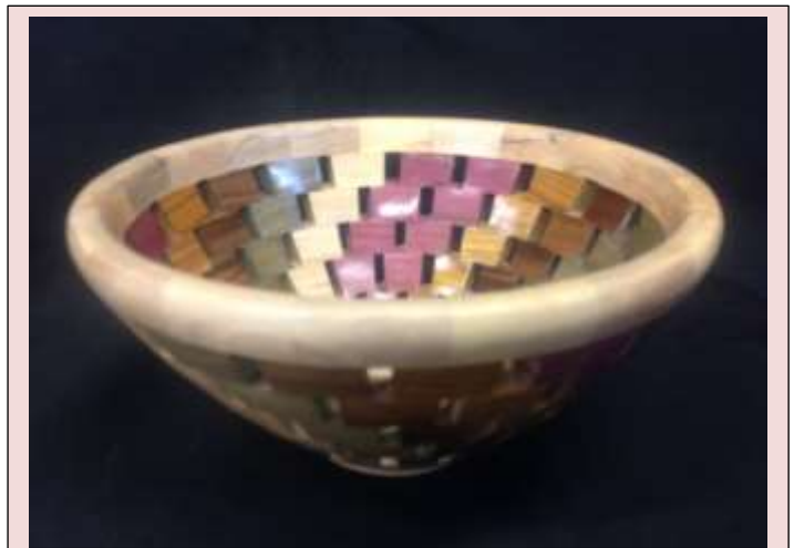
In the not-too-distant future COLIN will provide a special demonstration of the process for making one of these segmented bowls.