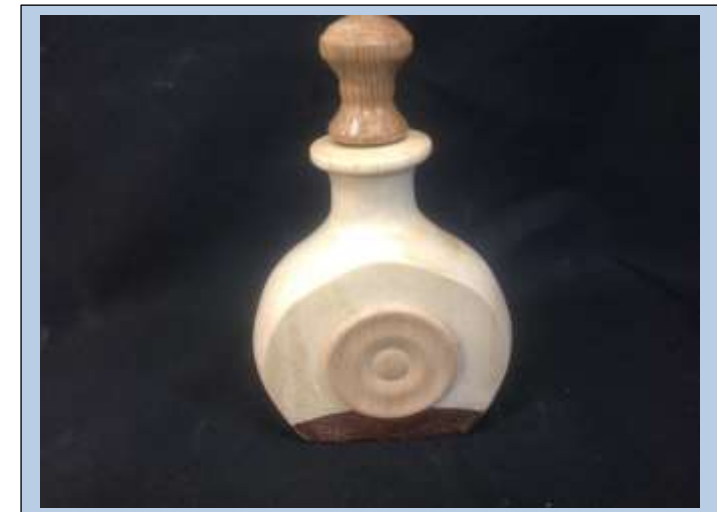
A well-made traditional drinking flask from the lathe of GRAEME SURGENOR . Very effective use of colour contrasts.