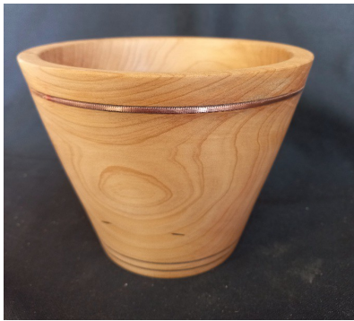
Macrocarpa with piano wire inlay from Greg.