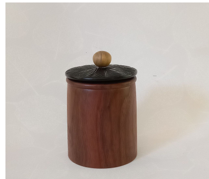
Black walnut lidded box with swamp kauri knob. Lid carved and painted. 140Mm . Richard.