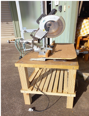
Thanks to Bill, our drop saw no longer sits on an old derelict rubbish bin, but on this newly constructed, solid table