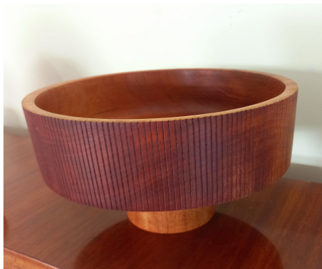
Avante garde pedestal bowl from John B. 240 dia. 160 high. Made by request.

A selection of night class people displaying their finished work. You can see their analytical minds at work as they study the outcomes. There are 7 in the class altogether and they are making great progress. By the time you receive the next Tutors Tidings the class will be finished for the year but we will include of display of some of their amazing work.