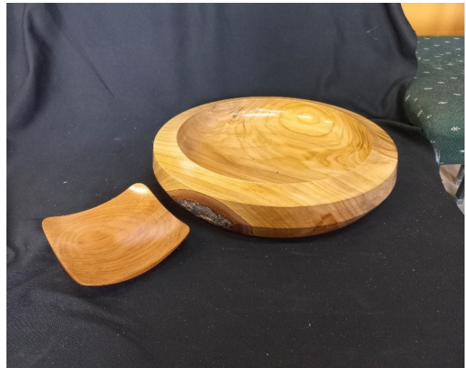
A study in contrasts. Small square plate from Denis and a large bowl from Malcolm P