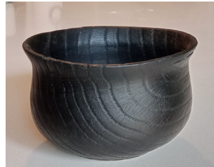
Richards second entry. Pin oak bowl. wet turned and allowed to warp and crack. Scorched and dyed.