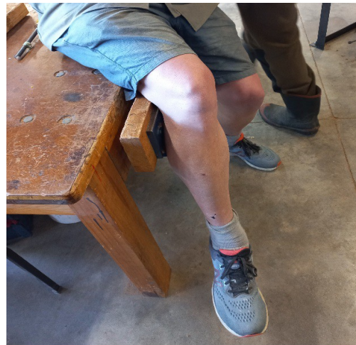
A well turned leg. This leg knows no fear. Even on the coldest days of winter it is present at club sessions.