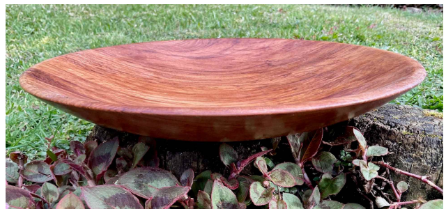
Two views of Garys beautifully coloured Matai Bowl