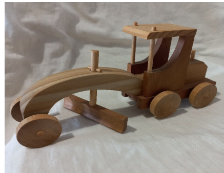
Handmade grader with plans available