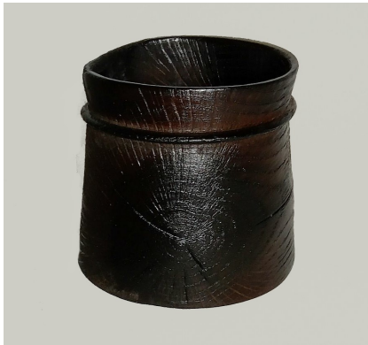
Creative turning from Richard. Pin oak vessel. Turned green and allowed to warp and crack. Charred then wire brushed and lacquered. 85mm