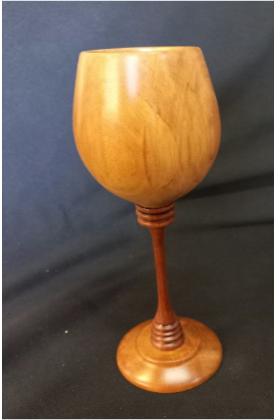
Bill recently got a some pointers on the use of a skew chisel the result is the stem on this goblet.