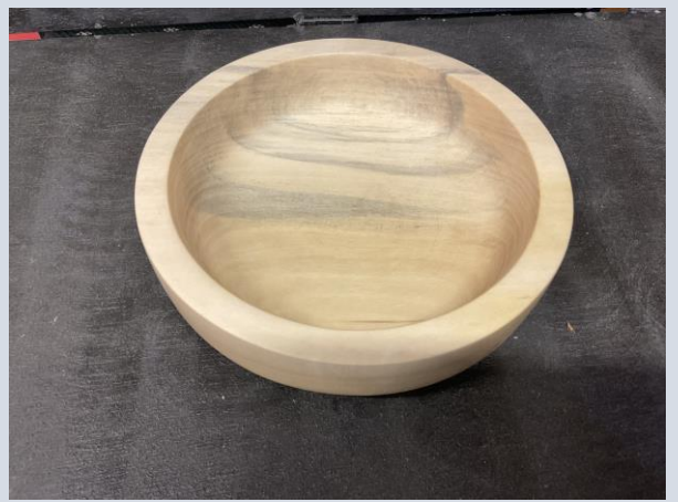
LYNDAL turned some poplar wood into a well-finished bowl.