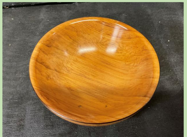
MALCOLM 's quick hit on a block of rimu wood. Easy-peasy with a top job here. Great finish.