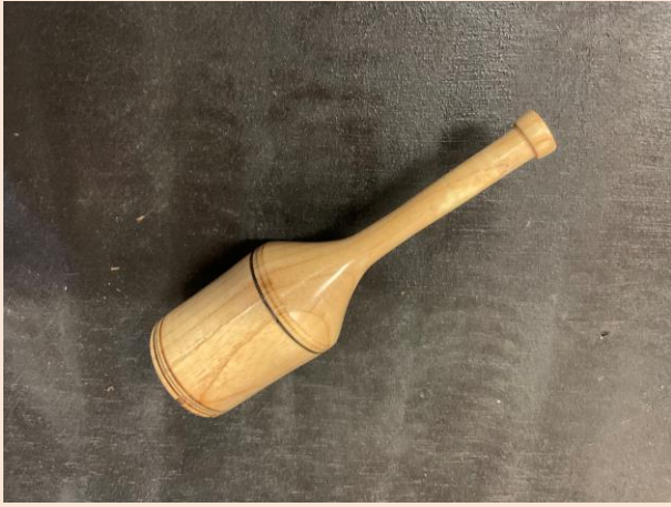
LYNDAL discovered the wonders of the buffing machine with this baby's rattle.