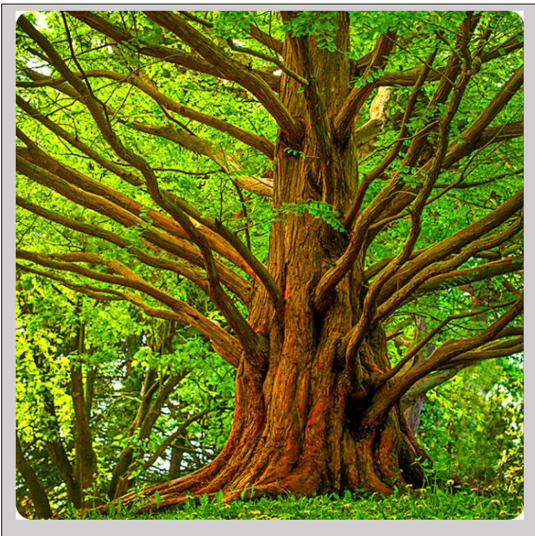
GIANT DAWN REDWOOD TREES

DID YOU KNOW..... People often study fossils, especially the fossils from trees and plants that lived many centuries ago. One of these fossils was for a tree called Dawn Redwood . Everyone thought that this huge evergreen tree was long extinct and only existed as a fossil specimen. But around 1942, some people found a small grove of dawn redwood trees growing in an isolated valley in China. They recovered some seeds from these trees and planted the seeds. Today, we have these trees growing all over the world.