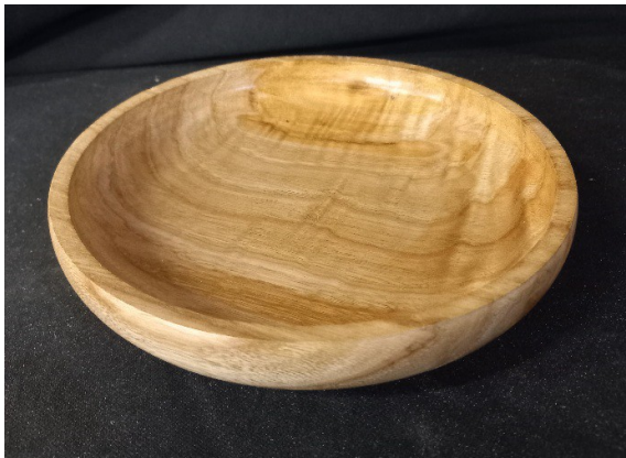
Shallow Chestnut bowl from Alan