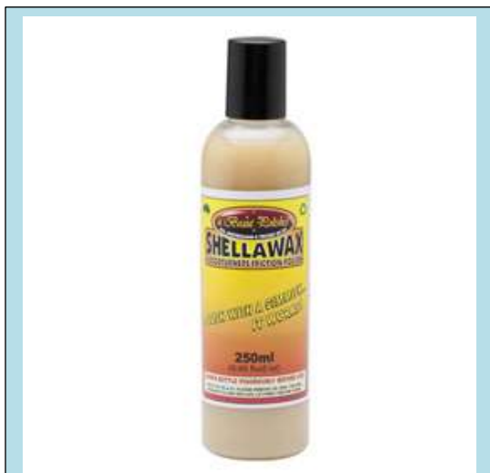
Shellawax is a friction polish and a favourite among Australian wood turners.

Now to apply a paste abrasive/rubbing compound. We use a product called Triple E (in a white pot marked EEE) Set the lathe to 1200 r.p.m. or higher. Apply at least two coats of EEE and polish off until a smooth satisfying finish is achieved.