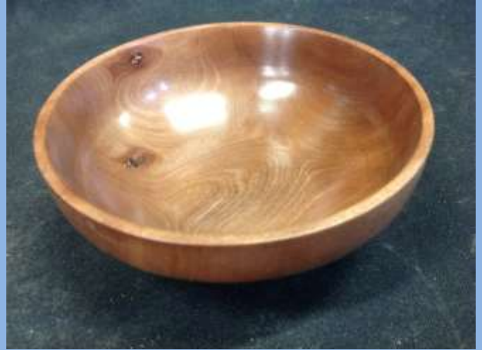
Great outcome WENDY Pohutukawa wood is ideal for smaller turnings especially as it always behaves itself on the lathe.