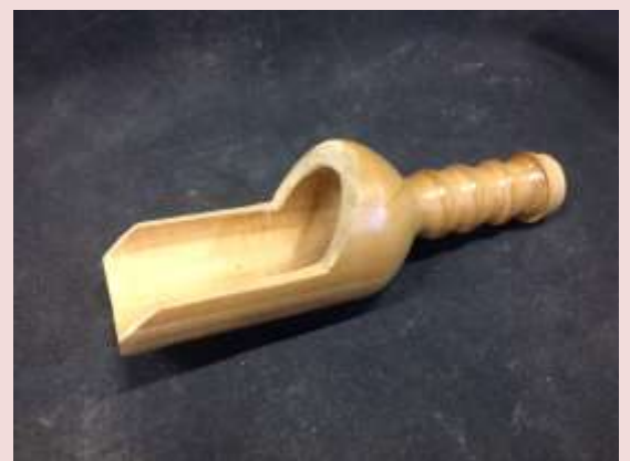
COLIN WHITE made a super-duper scooper. Now to make a much smaller edition that fits the challenge cup.