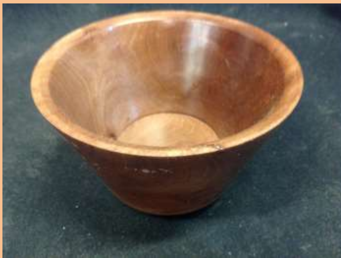
COLIN WHITE used pohutukawa wood to create this little wonder