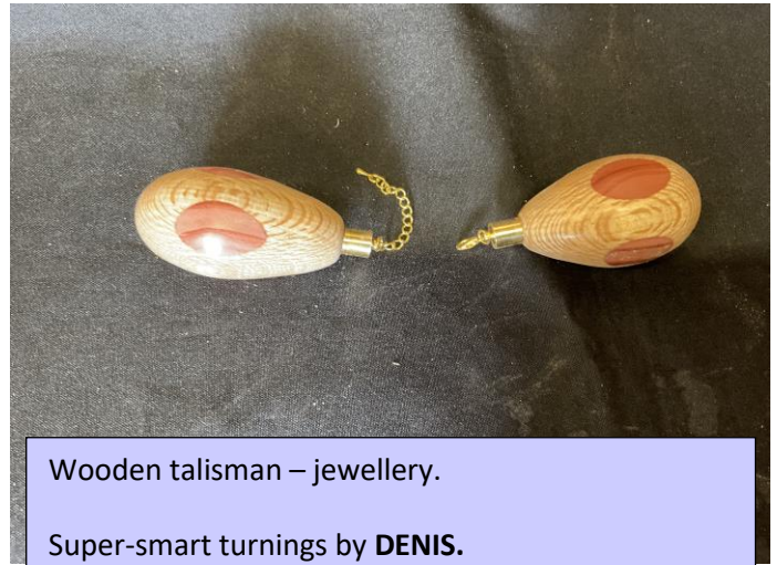
Wooden talisman – jewellery.