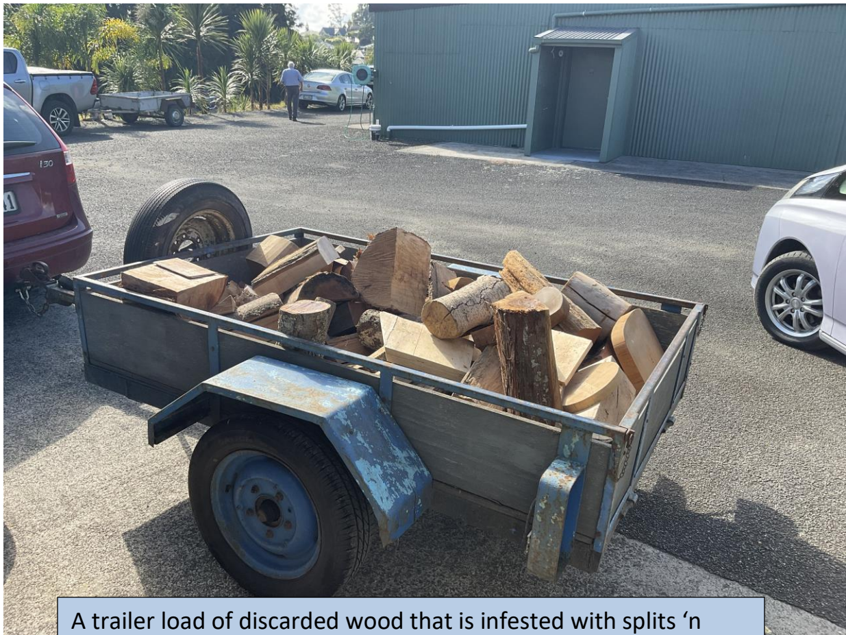
A trailer load of discarded wood that is infested with splits 'n cracks making the blocks unsafe for turning. Ah well..... the wood will keep some folk warm this coming