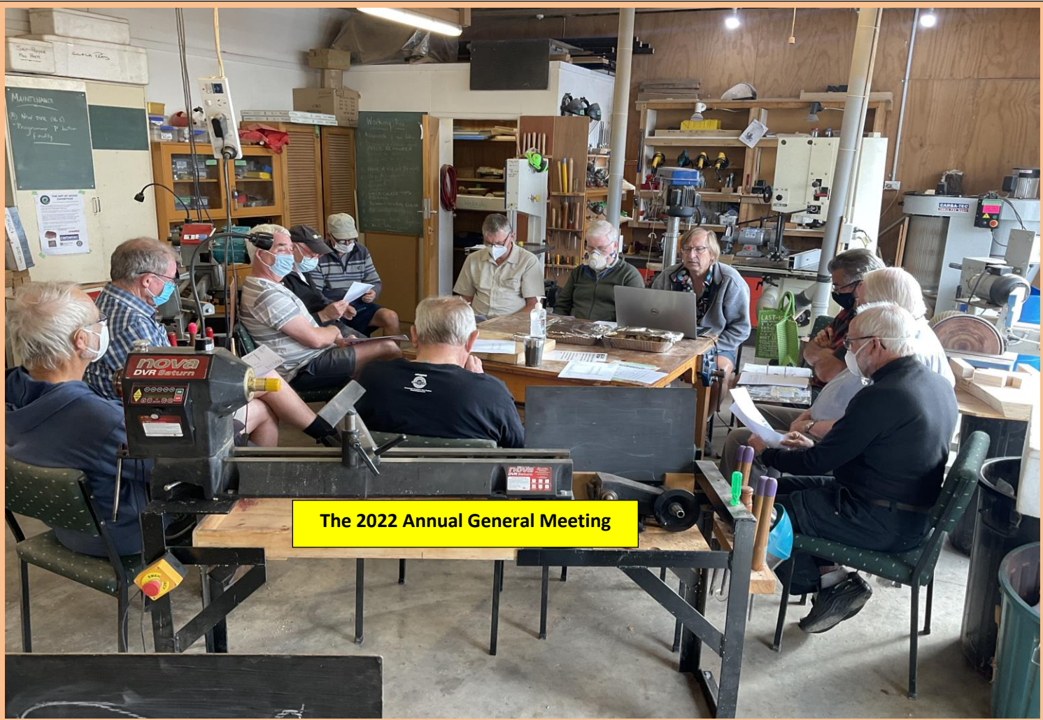
The 2022 Annual General Meeting