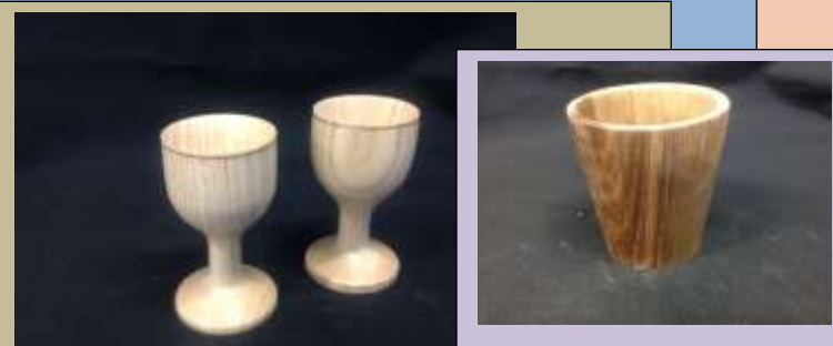
OK, Which of WENDY WHITE'S three super mini turnings would satisfy the size criterion for the current club challenge? It's mightily to great to observe Wendy's leaps and bounds turning progress.