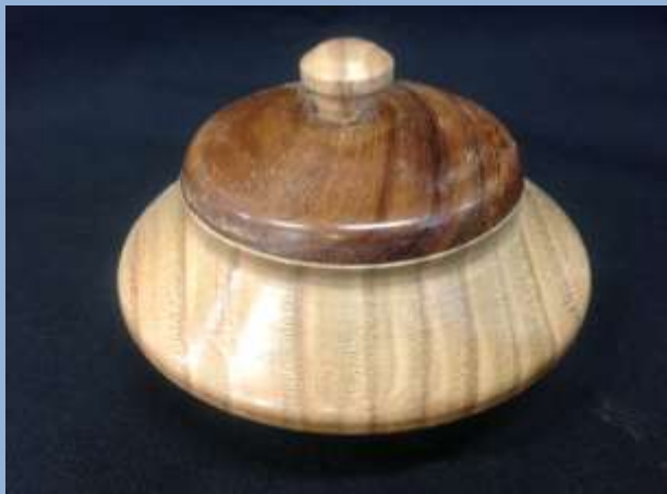
COLIN WHITE's chestnut and Tassie Blackwood lidded pot is an eye-catcher with its novel shape.