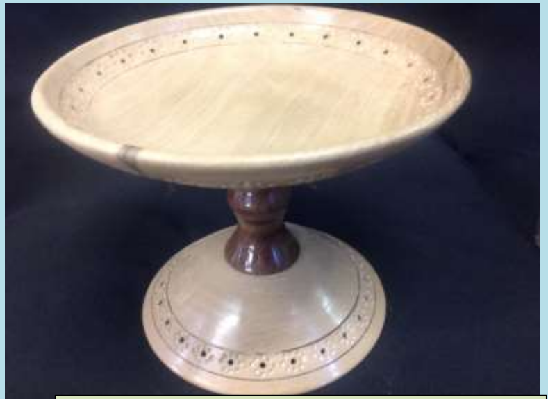
COLIN McKenzie – an excellent double bowl stand