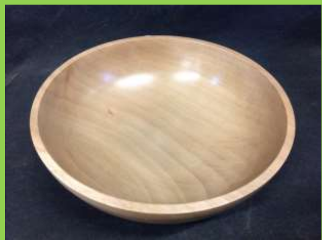
Carefully made by WENDY WHITE this brace of bowls feature a fine stria-free finish, continuous arcs for internal shape and evenly matched wall dimensions. Great work here Wendy!