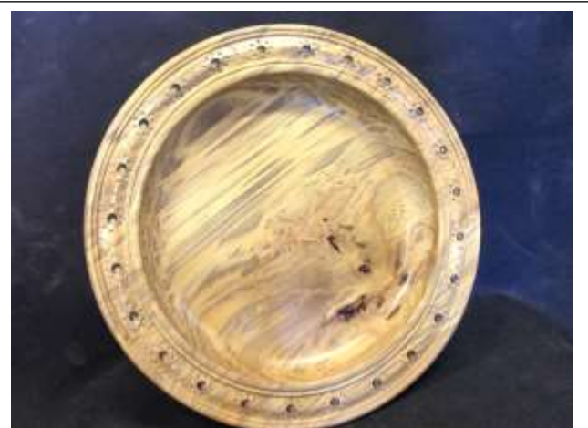
COLIN MCKENZIE brought these shells back from his southern holiday jaunt. These shells are FREE to a creative paua-thinking person. If you are interested I can show you how to accurately hollow out an outline of the shell's lip profile so you can inlay the entire shell into a block of your favourite wood. Right: Yellow heart Kahikatea wood turned into a super duper platter. Fascinating grain patterns and skillful etchings adds further interest.