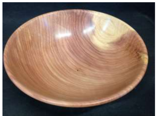
Beautiful juniper wood turned into a well-constructed, thin-walled bowl. Top job ROSS