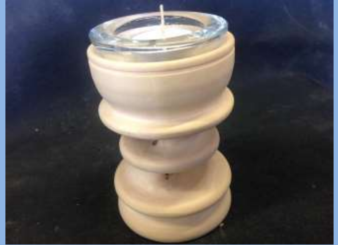
DAVE FREW's creativity once again released on a lathe. This time it's a turning cunningly made to appear as an off-set turning. (but it's not off-set)