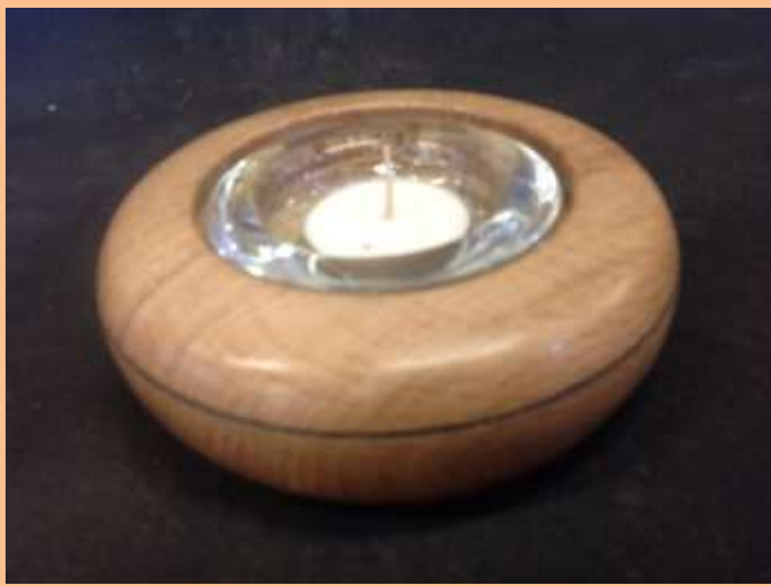
ALAN's mixed media of glass, wood, aluminium and wax combines into a nifty turning to hold a tea-light. An eye-catching design and a smooth finish.