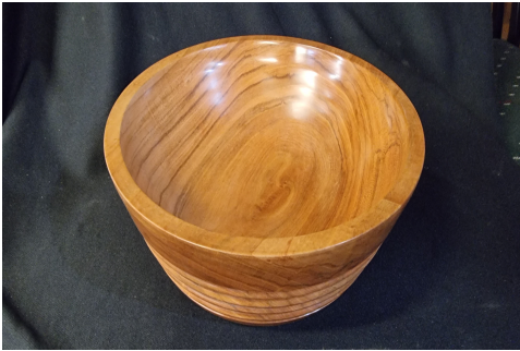
From Gary..... Two Cherry bowls