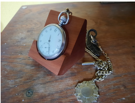
Last weeks mystery item, fully loaded