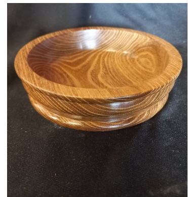
Oak Bowl from Bill