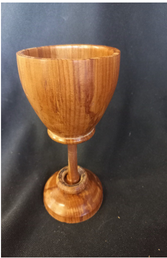
Matai goblet with captive ring by Malcolm P