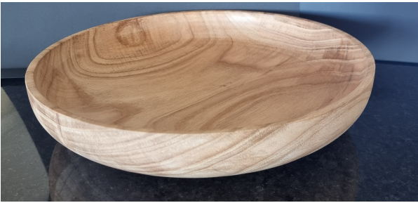
Three legged Chestnut bowl from Spenser