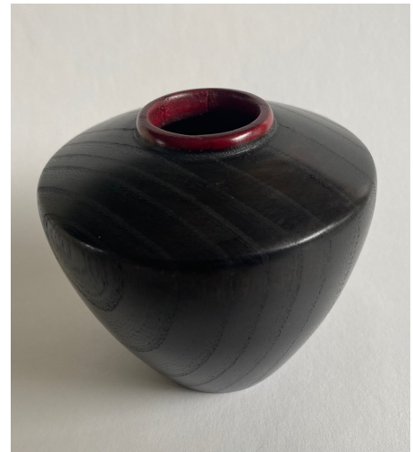
Murray has created an Ash hollow form 75mm high x 80mm diameter. 3.0mm wall thickness. Stained- Black inside and out with Red rim.