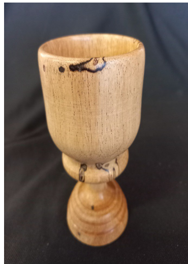
Spalted Maple Goblet by Alan